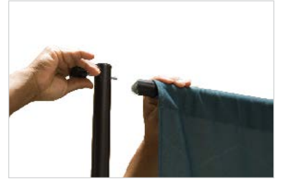
Clutch lock offers secure horizontal and vertical adjustments.