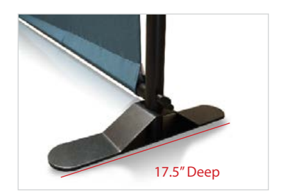
Sturdy Steel "Bridge" Support Base.

Graphic Turnaround Time is 2 business days for up to 2 sets