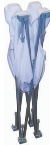
Collapsing Frame & Attached Graphic