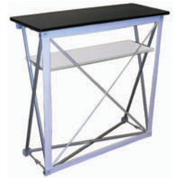
Frame, Counter Top and Storage Shelf