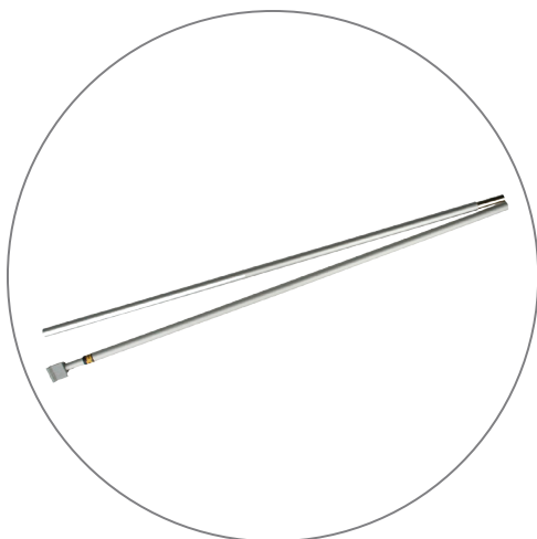
(QTY 1): Telescopic Pole

• Dimensions: 70.125" H (When assembled)