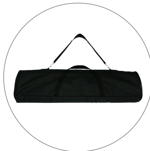
(QTY 1): Travel Bag

• Dimensions: 98" H (When Telescopic Pole extends)