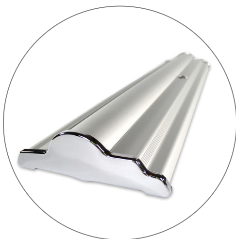
(QTY 1): Steppy Retractable Stand