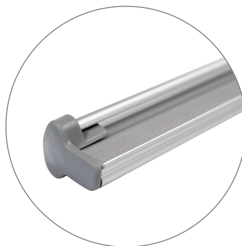
(QTY 1): Clamp Bar