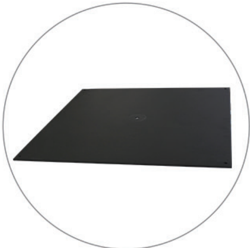
(qty 1) Square iron base