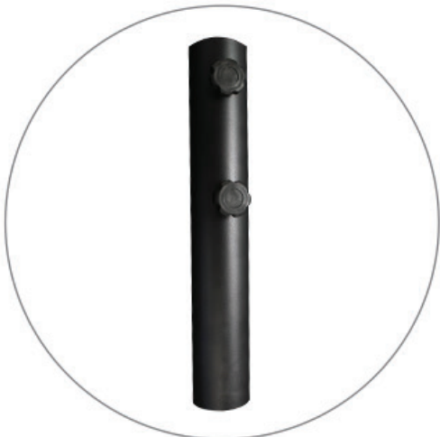
(qty 1) Pole holder with tension knobs