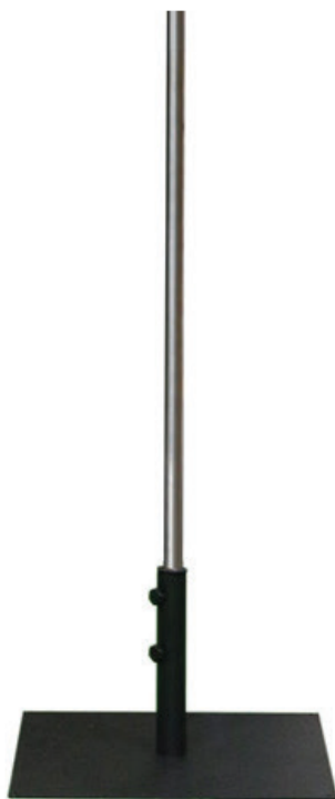
(shown with inserted pole)