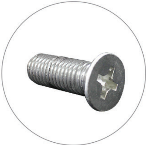
(qty 1) Large socket screw