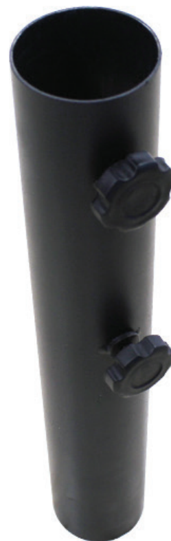
pole holder with tension knobs