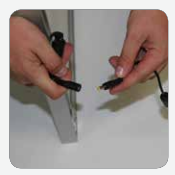
2. Connect the AC adapter to the frame and power cord.