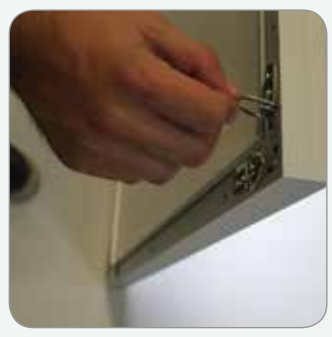
4. The Aspen Fabric Frame can be hung either by landscape or portrait.