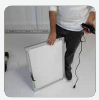
1. Lay Aspen Fabric Frame parts out.- Frame- AC adapter