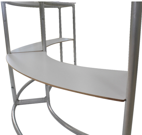
Shown with optional shelf