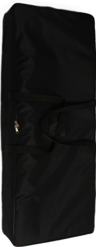
Black nylon travel bag