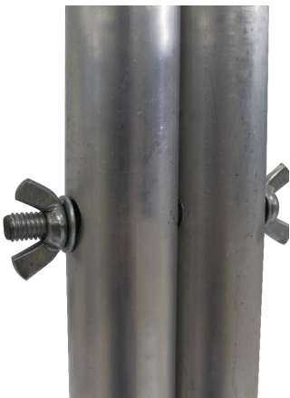
Screw and wingnut frame connection