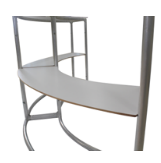
Shown with optional shelf