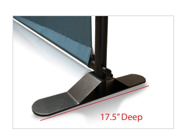
Sturdy Steel "Bridge" Support Base.

Graphic Turnaround Time is 2 business days for up to 2 sets