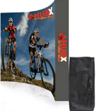
*Package includes padded nylon travel bag