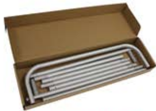
Shown with standard packaging