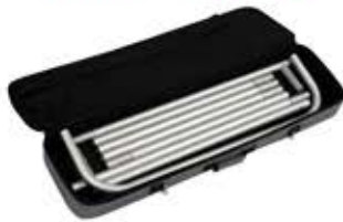
Shown with optional Silver Bag